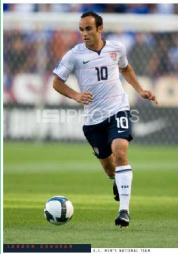
Landon Donovan