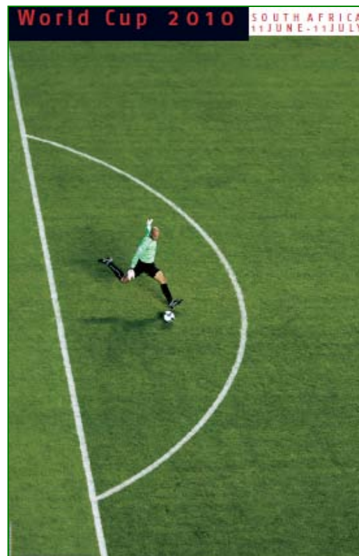
© America.gov - Download and print the 2010 World Cup Poster (PDF, 5MB).