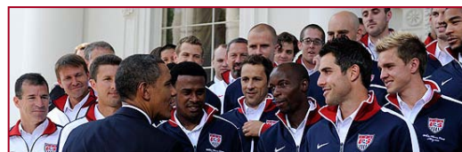
U.S. Men's World Cup Team Receives Presidential Send-Off

Article: Leisurely Practice for U.S. Before Real Work Starts (NYT, June 6, 2010)