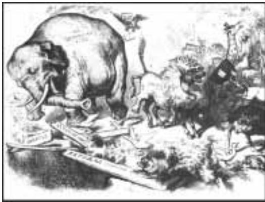
© Third Term Panic by Thomas Nast

How did Republicans pick the elephant, and Democrats the donkey, to represent their parties? - Their origin as symbols for the parties is attributed to a political cartoonist, Thomas Nast, who used the two animals in cartoons drawn for Harper's Weekly in 1874. Why Nast chose the donkey and the elephant is a complicated story. Over time, Republicans came to view the elephant emblem as a sign of strength and intelligence. Democrats seized the "jackass" label, and transformed it into a clever and courageous donkey. More C-SPAN: Capitol Questions