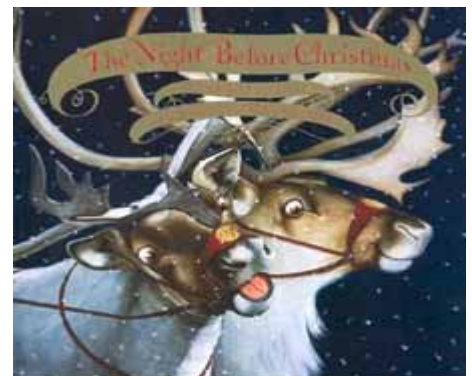
© The Night Before Christmas (Scholastic)