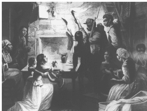
A Union soldier reads the Emancipation Proclamation to newly freed slaves. After Lincoln signed the Proclamation, celebrations took place throughout the country.