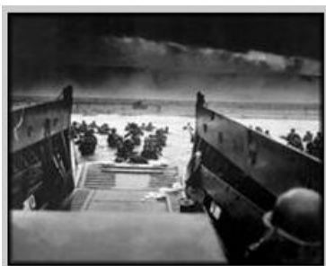
American troops landing at Normandy, June 6, 1944.