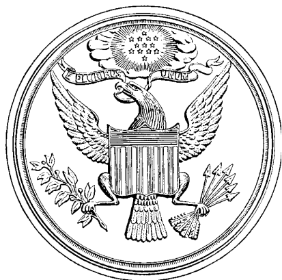
Great Seal of 1841, engraved in steel by John Peter Van Ness Throop of Washington, DC. It departed from 1782 design by showing only six arrows in eagle's claw and by giving stars five, rather than six, points. It also added fruit to olive branch.