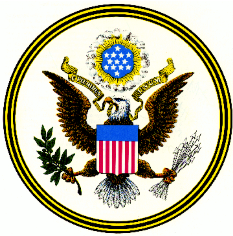
Obverse Side of the Great Seal