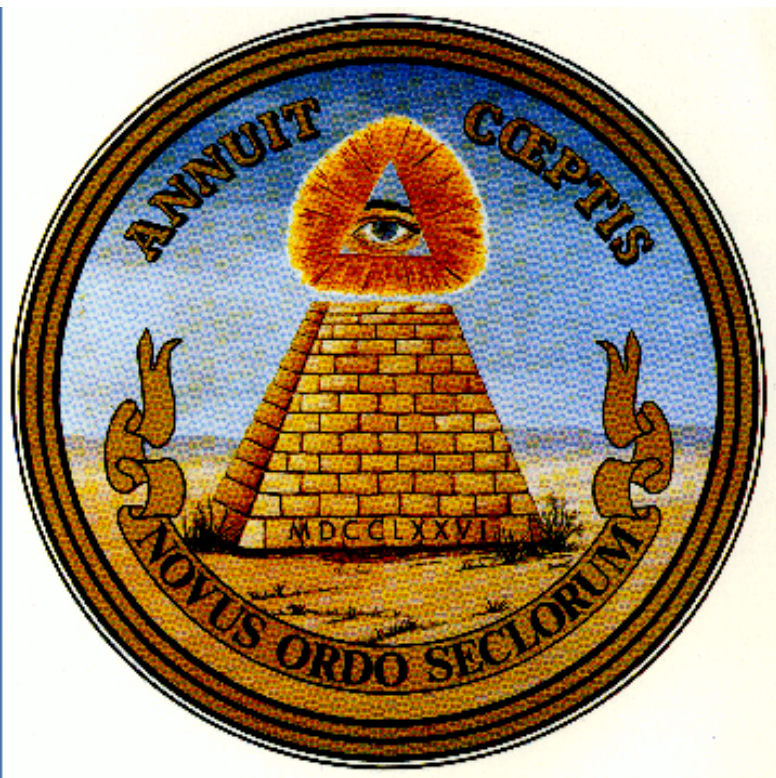
Reverse Side of the Great Seal