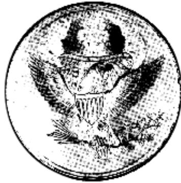
Masi Treaty-Seal Die of 1825, used for pendant seals impressed in wax and enclosed in gold or silver boxes, then fastened with ornamental cords and tassels to treaties.

on the branch of an olive tree. He clearly defined 13 arrows, made the shield narrower and more pointed and altered its crest, and centered the motto E Pluribus Unum over the eagle's head. This beautiful seal was used for treaties until 1871, when the government ceased using pendant seals and retired the die. It is available for viewing in the National Archives. □