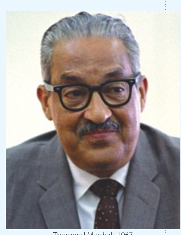
Thurgood Marshall, 1967