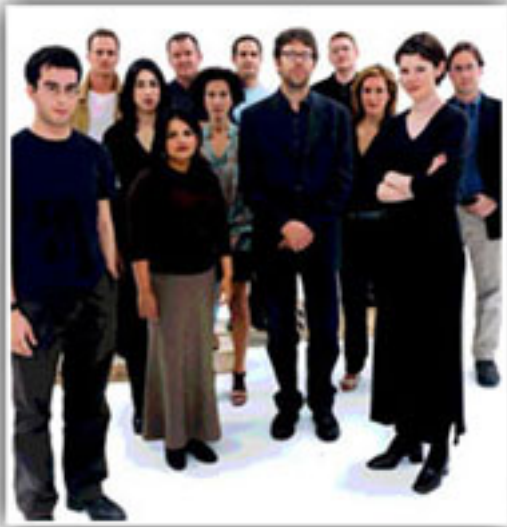
Some of the new faces on America's literary scene.

One of the more interesting things about writing criticism for many years is that from time to time I am called upon to revisit a particular author or development, at which point I usually discover not only how much my tastes and inclinations have changed, but also that my subjects have refused to stay embalmed in the mummy-wrap of what I used to think. This has been borne out most vividly recently, as I have been asked to venture a concise overview assessment of the state of