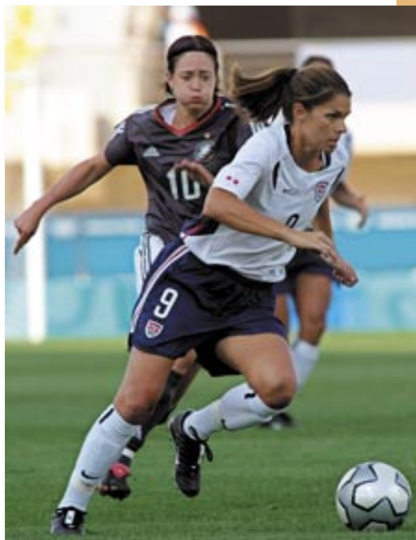
Mia Hamm (previous page) celebrates a teammate’s goal in the last game of her professional career, December 9, 2004, against the Mexico women’s national team. (below) Mia goes for the ball in a game against Germany during a semifinal match of the 2004 Olympic Games.

Throughout our lives, our self-esteem goes down when we feel like a failure, and it goes up when we feel successful. Doing something well, being praised, and feeling loved goes a long way. We all need to explore opportunities where we can be good at something and feel good about ourselves. Physical activity and sport participation is a terrific way to build up your sense of self-confidence and self-worth. You get to set goals for yourself, you get challenged, you feel good about your accomplishments, and you learn that after today’s failure—there’s tomorrow’s chance. ■