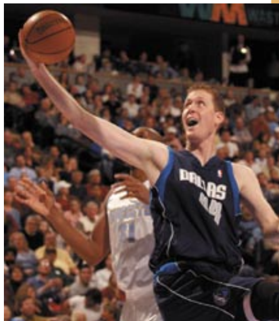
Dallas Mavericks' Shawn Bradley (previous page) poses with a fan after a December 2004 game. (below) Shawn pulls in a rebound during a January 2004 game against the Denver Nuggets.

These things still happen today. It will probably happen the rest of my life. I will always be 7 feet, 6 inches (2.29 meters) tall. I wouldn't change that for anything. People will always look because it is not every day that you see someone that tall. I learned that at a young age and I now try to teach my own children that they are important! They matter and, most importantly, God loves them. That is the message I give to you. Regardless of your race, religion, ethnic background, or circumstances ... God loves you! ■