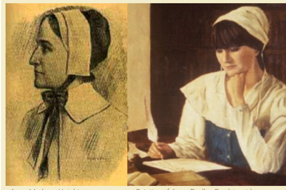
Anne Marbury Hutchinson

The thousands of women colonists of this era made huge contributions to the settlements of the New World. They raised children and educated them as they cleared the wilderness alongside their husbands, built cabins, and made or traded basic necessities. Women were the mainstays of church and community.