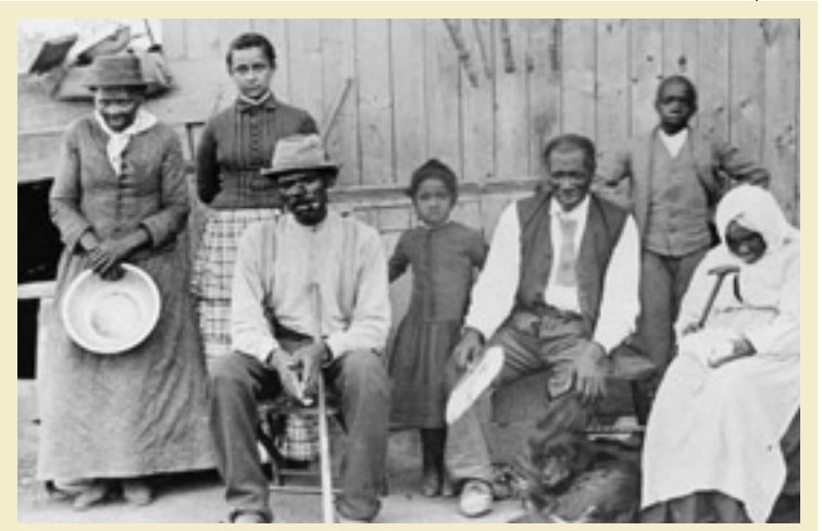
Harriet Tubman, far left, whose talents as Underground Railroad scout freed 300 slaves before the Civil War.

Owing to inefficiency and perhaps lingering racial discrimination, Tubman was denied a government pension after the war and struggled financially for many years. She pressed to advance the status of women and blacks, to shelter orphans and elderly poor people.