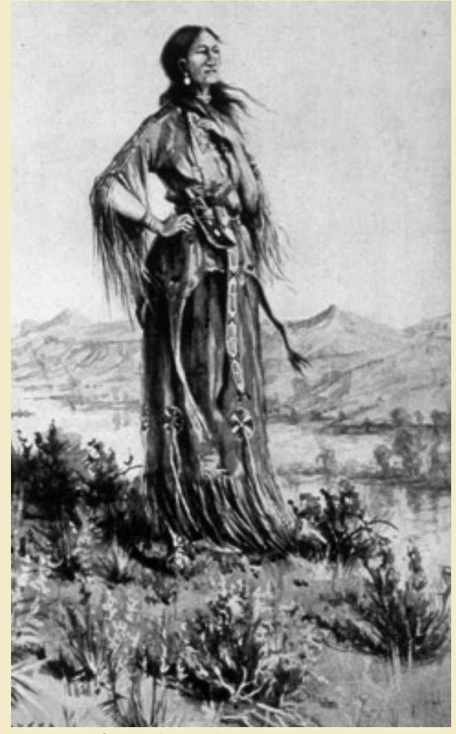
Sacagawea, from a drawing by E.S. Paxson.

Following the expedition, Sacagawea and her husband lived for a time in St. Louis before returning to the Dakotas. She is widely believed to have died in 1812, although an elderly woman claiming to be Sacagawea passed away in 1884. In 2000, an artist's imaginary rendering of Sacagawea cradling her son was added to U.S. currency on a dollar coin.