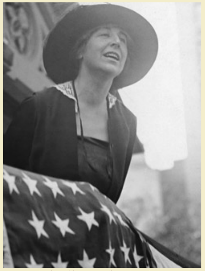
Jeannette Rankin addresses a rally at Union Square, New York, September 1924.

Rankin returned to social work and to reform organizations, such as the National Consumers' League, the Women's International League for Peace and Freedom, and — in 1919 — attended the Second International Congress of Women in Zurich. Reelected to Congress in 1940, she cast the only vote in Congress against war on Japan after the attack on Pearl Harbor. With her political career ended by this unpopular vote, Rankin devoted the rest of her life to her favorite causes. At age 86, for instance, she participated in the March of Washington opposing the Vietnam War.