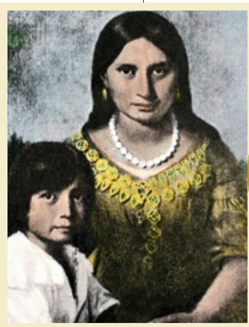
Pocahontas, after a 1616 engraving by Simon van de Passe.

V he survival of the American colonies and later the newly born United States was never guaranteed — far from it. Settlers in the early 17th century — even in flourishing outposts — could count on harsh living conditions, scarcity of food, disease, and toil. The "lost colony" of Roanoke, Virginia, is ample proof of the difficulties they faced. Two centuries later, in the 1800s, Americans would trek westward across the Mississippi River from the relative comfort of established cities, seeking